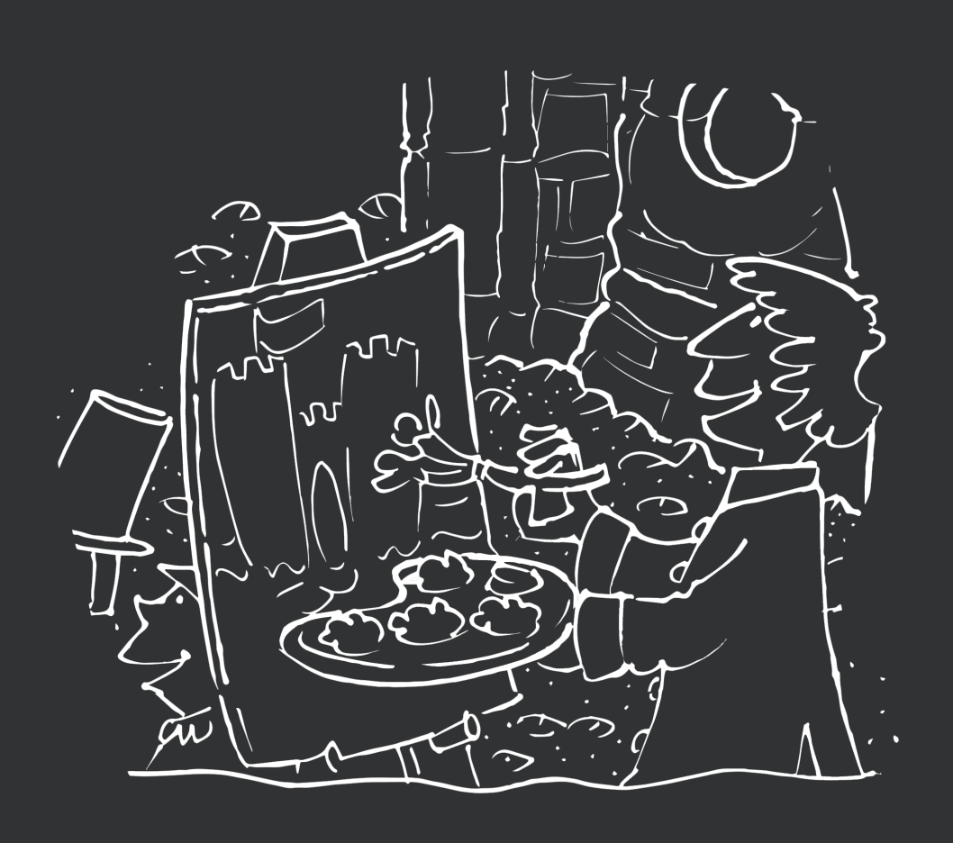
15 The world-famous JMW Turner is just one of the many artists who have painted the Westgate over the past six centuries.